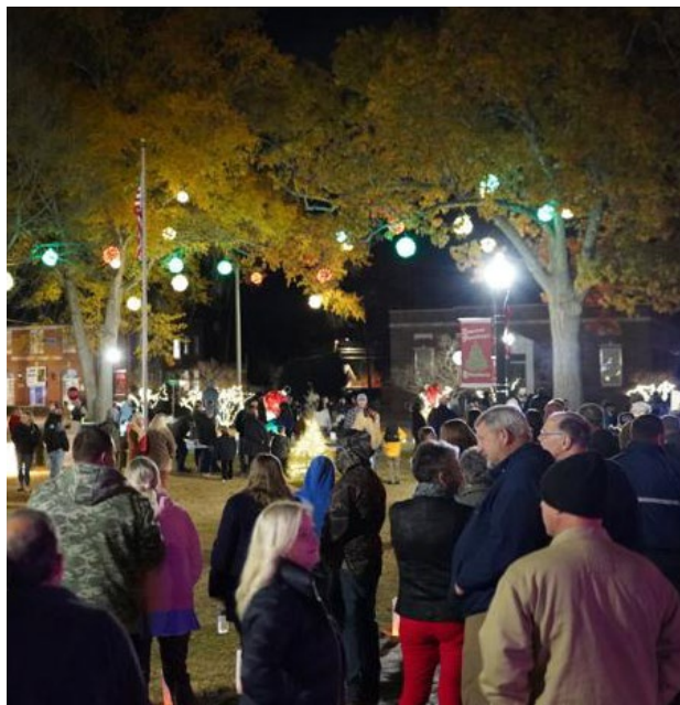
Community event in Rockingham, NC

NCDOT also completed a BCA for each of the WALK NC cities/towns.