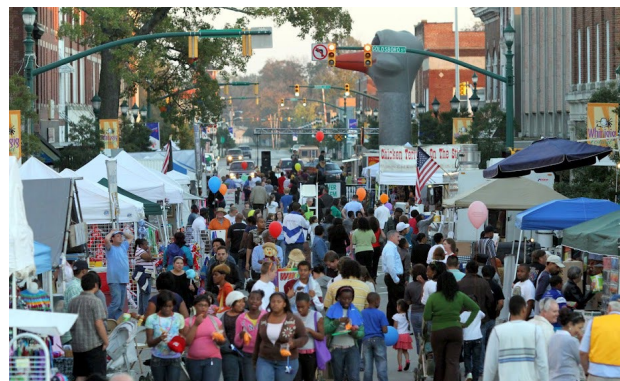
Downtown community and public outreach events held in Hamlet, Henderson, Oxford, and Wilson, NC