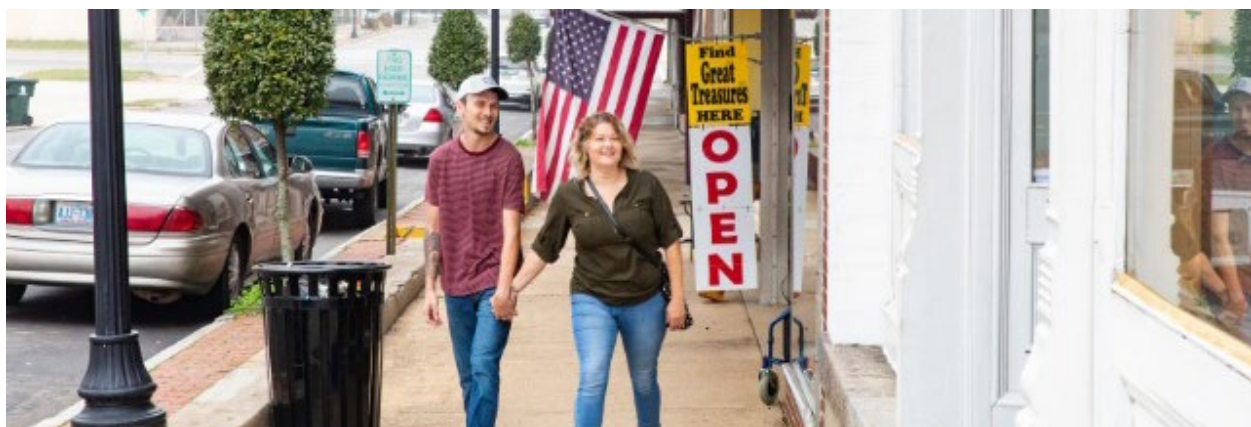
Pedestrians walking in downtown Weldon, NC

All tracts are in rural areas. All of the census tracts, except for 9609, are classified as Historically Disadvantaged Communities. More than half of the census tracts are in Areas of Persistent Poverty.