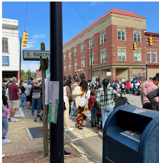
Community event in Selma, NC